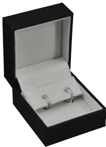
NY01H Huggie Earring 45x50x32