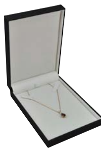
NY75A Necklet 110x158x32