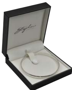
NY21C Bangle 85x90x30