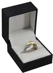
NY02 Single Ring 45x50x37