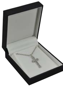
NY05B Pendant 70x82x28