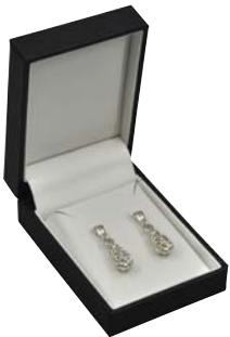
NY07 Earring/Pendant 47x67x27

Note: Dimensions shown are external. Width x Depth x Height mm