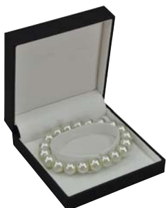
NY21B Bangle 85x90x30