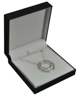
NY21A Pendant 85x90x30