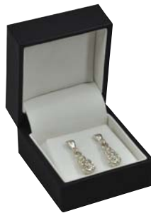
NY01A Stud Earring 45x50x32