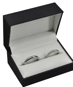
NY04 Twin Ring 75x50x35