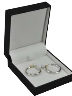
NY05C Hoop Earring 70x82x28