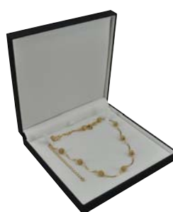
NY77A Large Necklet 160x160x30