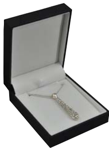
NY05A Pendant 70x82x28