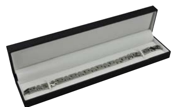
NY06A Long Bracelet 225x50x25