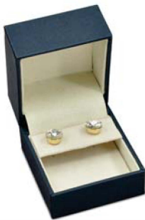
BL01H Huggie Ramp Pad