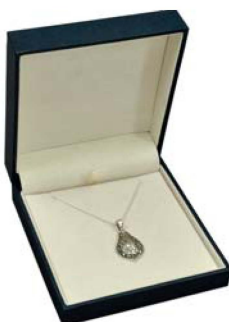
BL21A Large Pendant Lift Out Strut