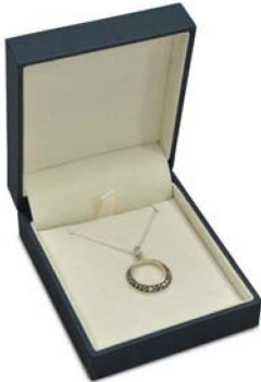
BL05A Pendant Lift Out Strut