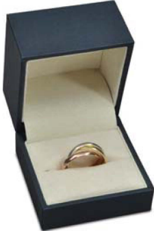
BL23 Large Ring Ring Trench