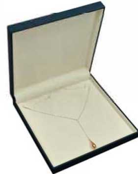
BL79A Necklet 2 Hooks