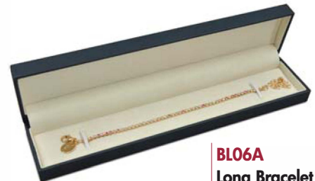
BL06A Long Bracelet Platform with 2 Clips