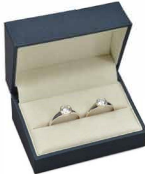
BL04 Twin Ring Ring Trench